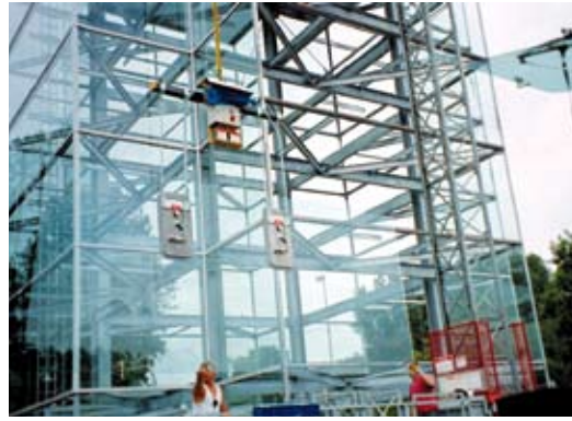
Vario handling glass elements