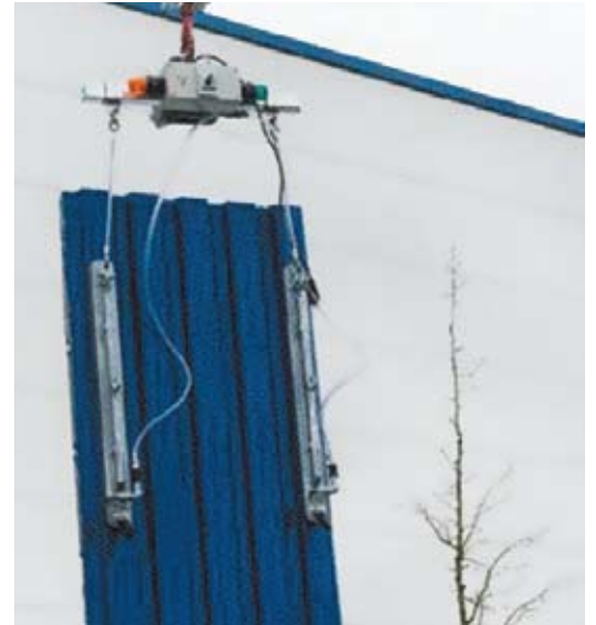
Vario handling façade elements