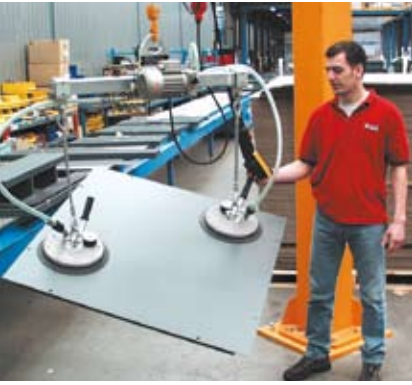
Vario handling sheet metal plates